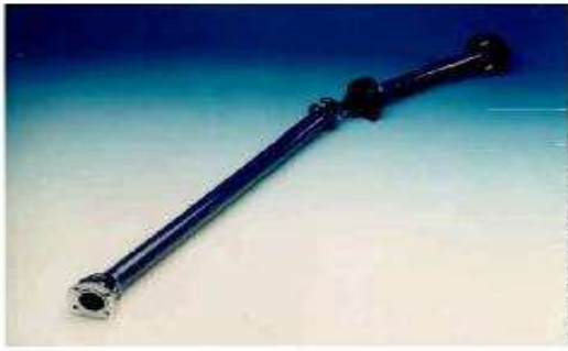
Fig. 1. Photographic view of a two-piece steel