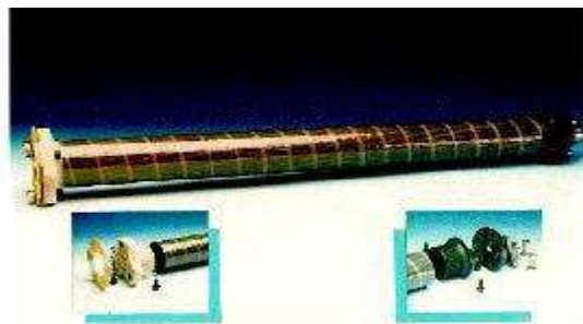
Fig.2. Photographic view of a one-piece composite drive shaft